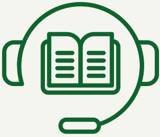
Initiatives within UNC