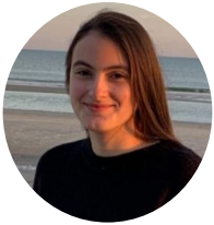
Gabriela 'Gabby' Goodman James 'Jim' Johnson Policy Impact Award